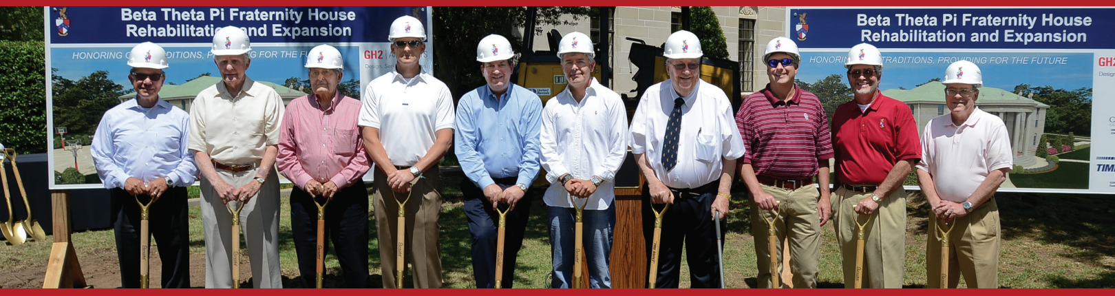
Campaign leadership was on hand to begin the work for the chapter's renovation. Your support is needed during this exciting time in the chapter's history.

Both yesterday and today, Beta Theta Pi makes us proud. When we look back at our own Gamma Phi experience, we can see how the friendships, leadership, and campus involvement—even decades ago—helped shape who we are now. As collegiate members, 800 Chautauqua was our home at OU. We lived there together as brothers, as a family. That Beta family still exists today.